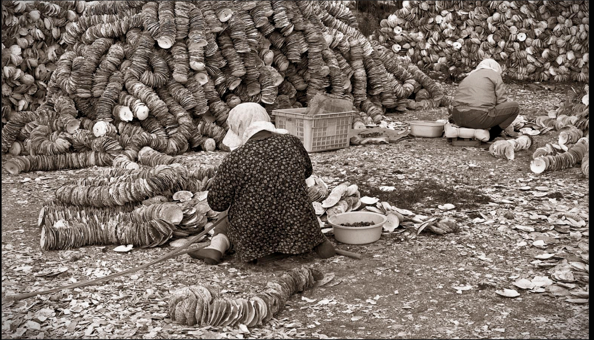
Women Stringing Shells, Sawada, Japan