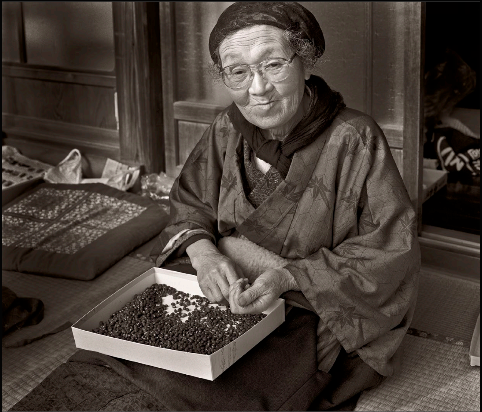
Grandmother Sorting Beans, Surisawa, Tohoku, Japan