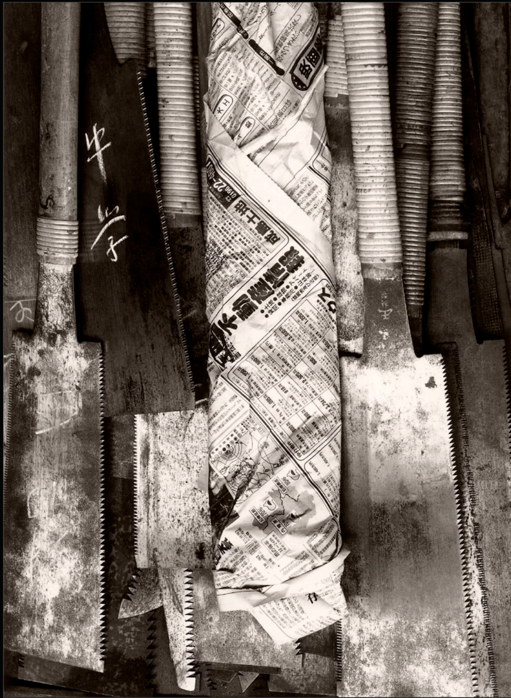
Handmade Saws, Tōno, Japan