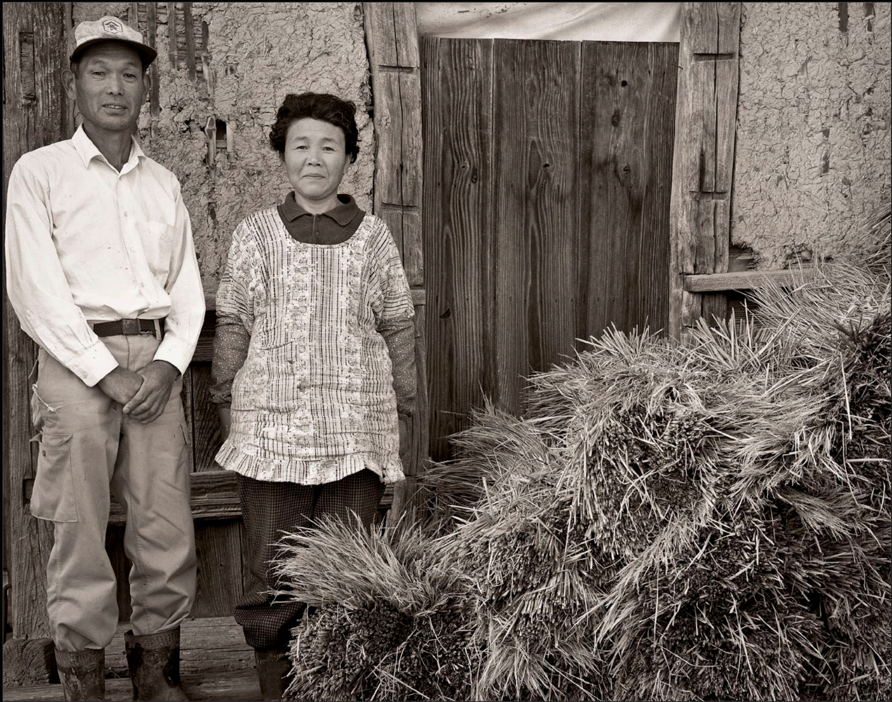
Farm Couple, Surisawa, Tohoku, Japan