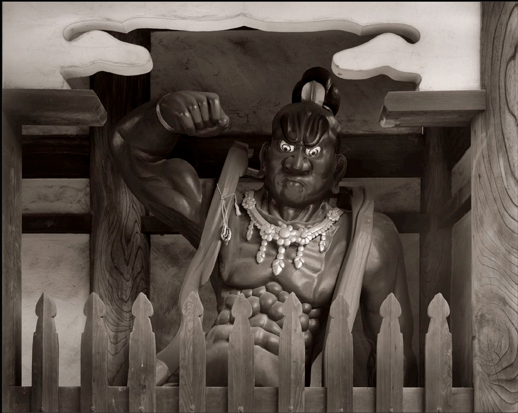
Guard at the Temple Gate, Kyokurin-ji, Odate, Aomori-ken, Japan