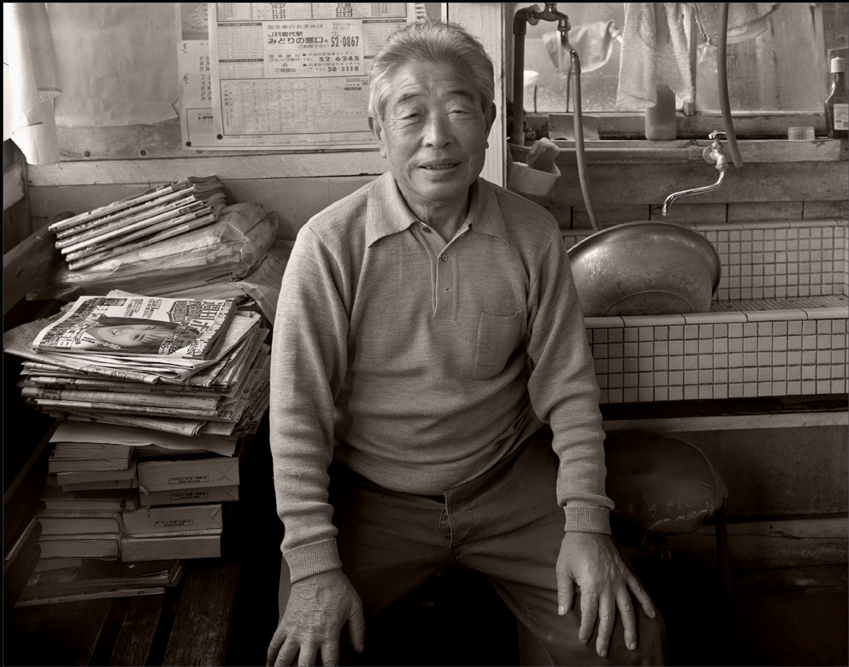
Barber, Higashi-Noshiro, Akita-ken, Japan