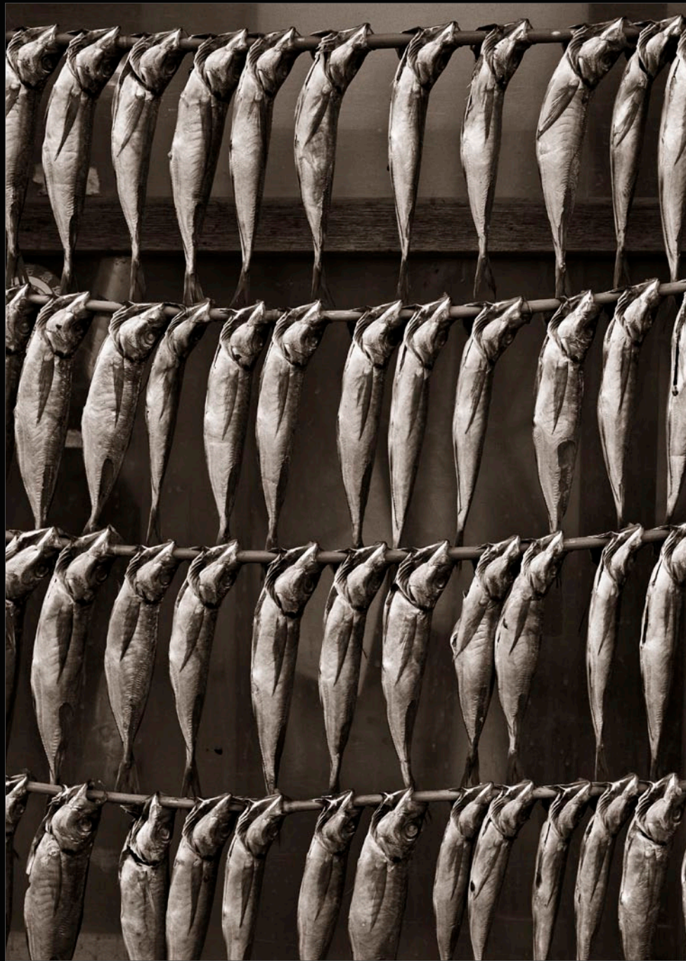
Drying Fish, Onagawa Fish Market, Onagawa, Japan