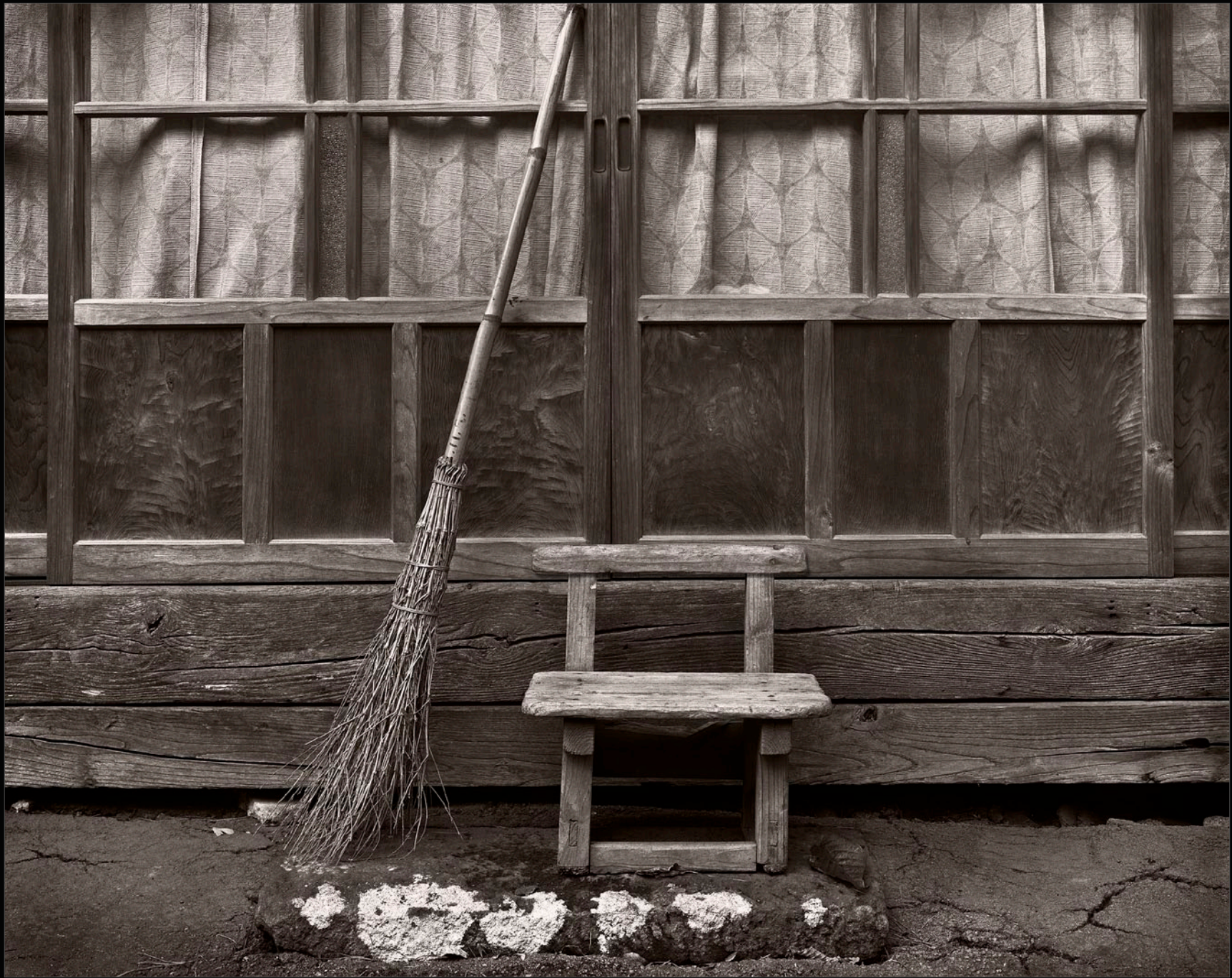
Worker's Broom, Konashi, Iwate-ken, Japan