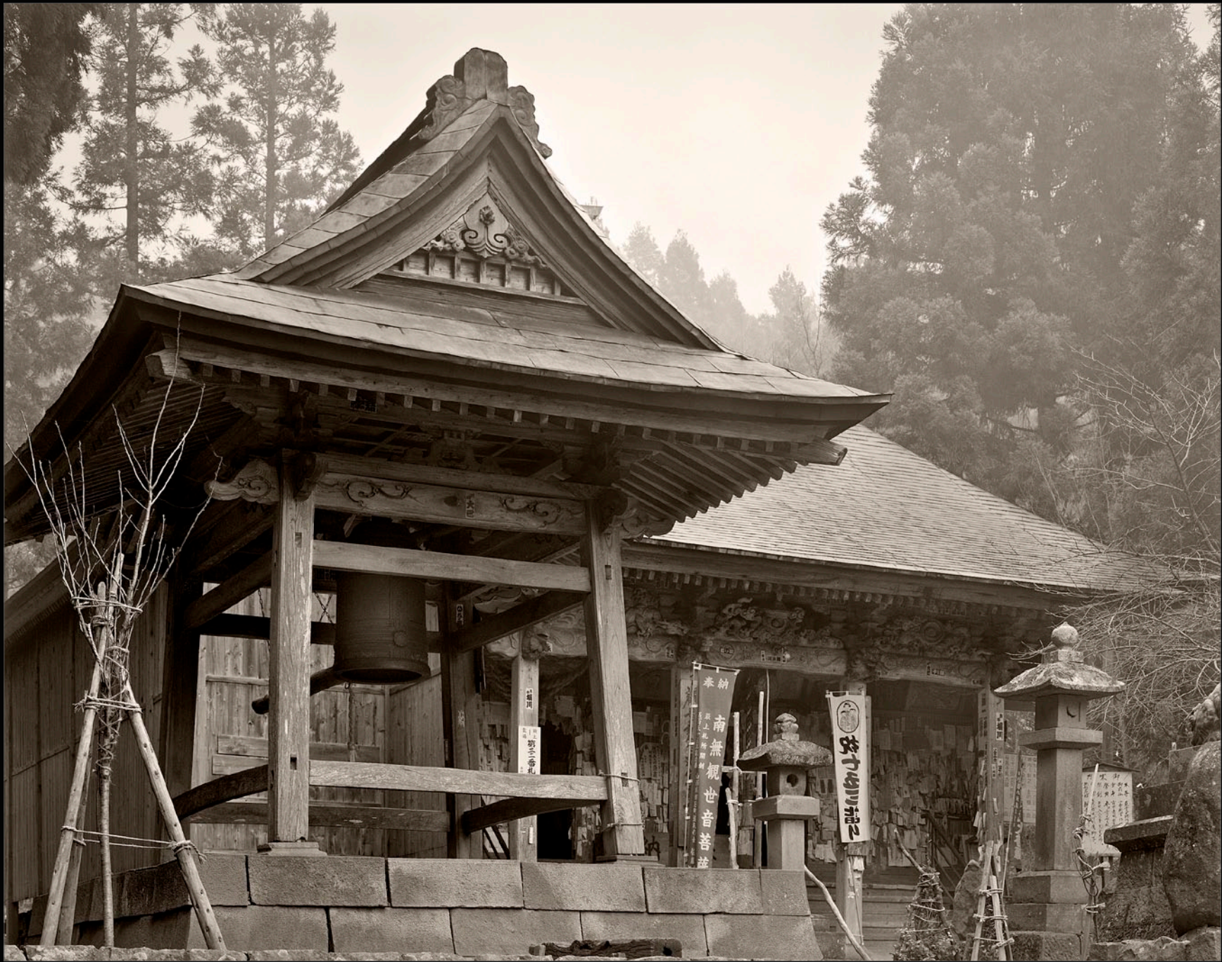
Tozen-in Temple, Uzen-Akakura, Yamagata-ken, Japan