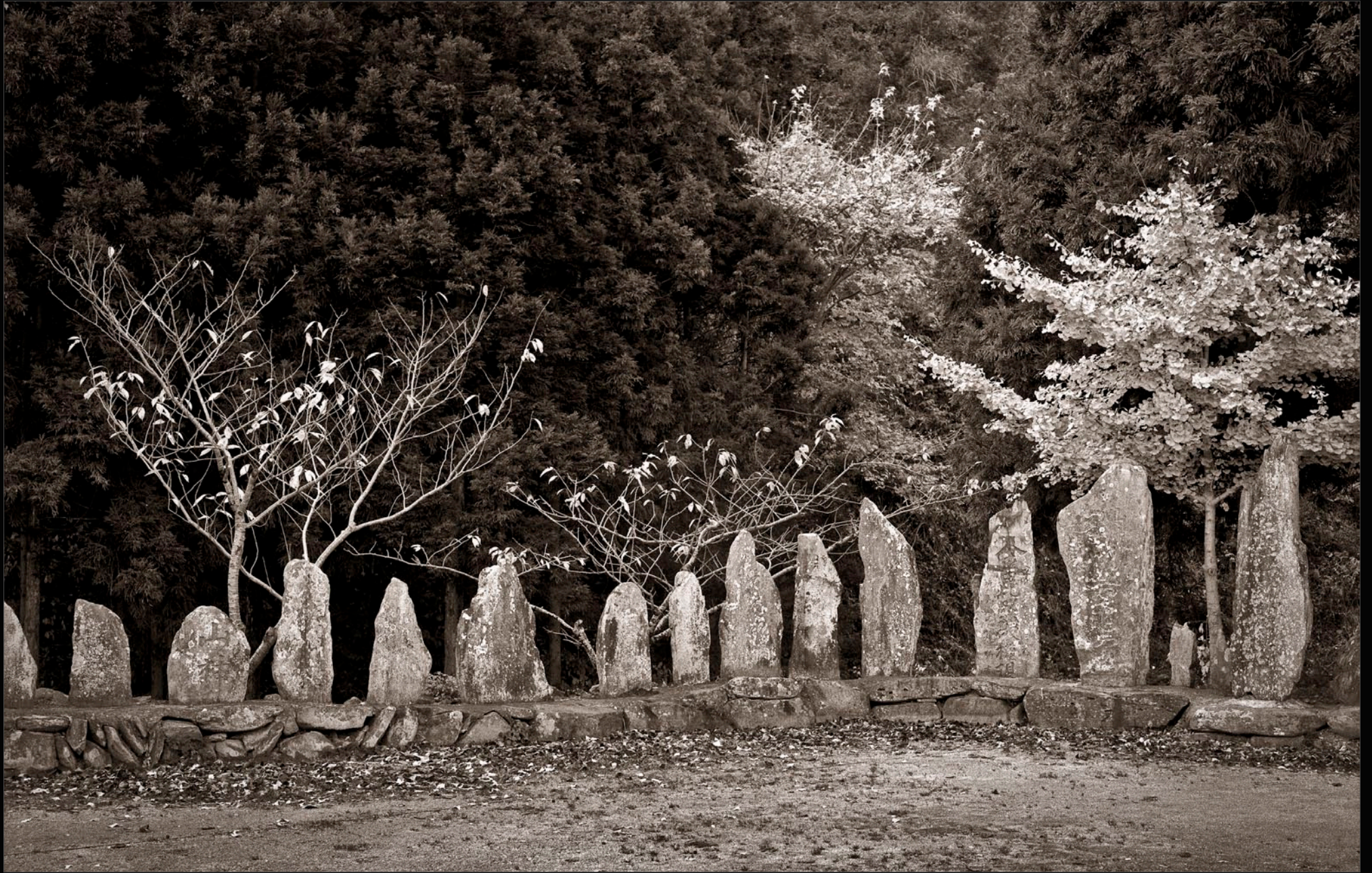
Row of Stone Sekihi, Ryori, Japan