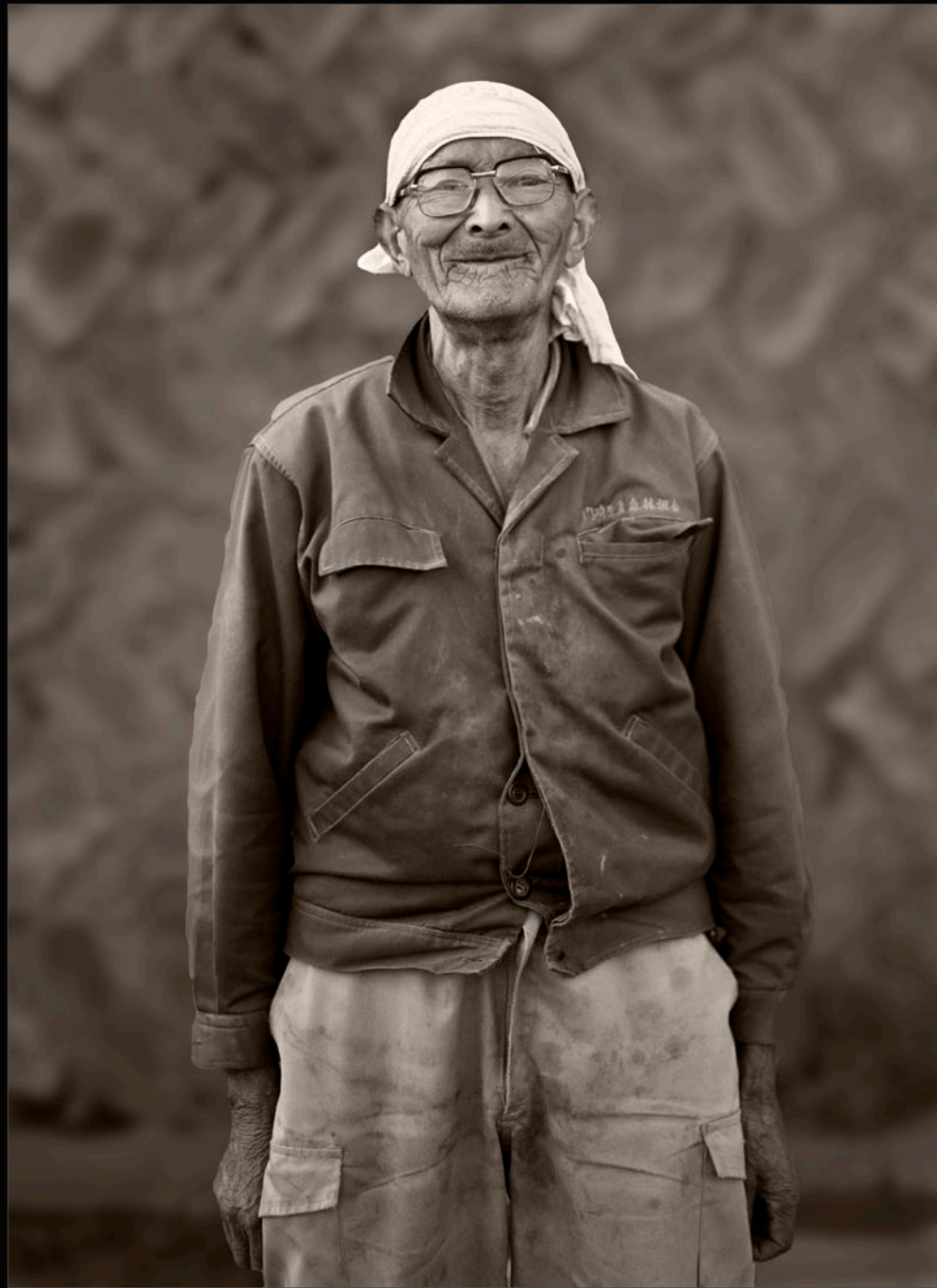
Rice Harvester, Rikuchu Kanzaki, Iwate-ken, Japan