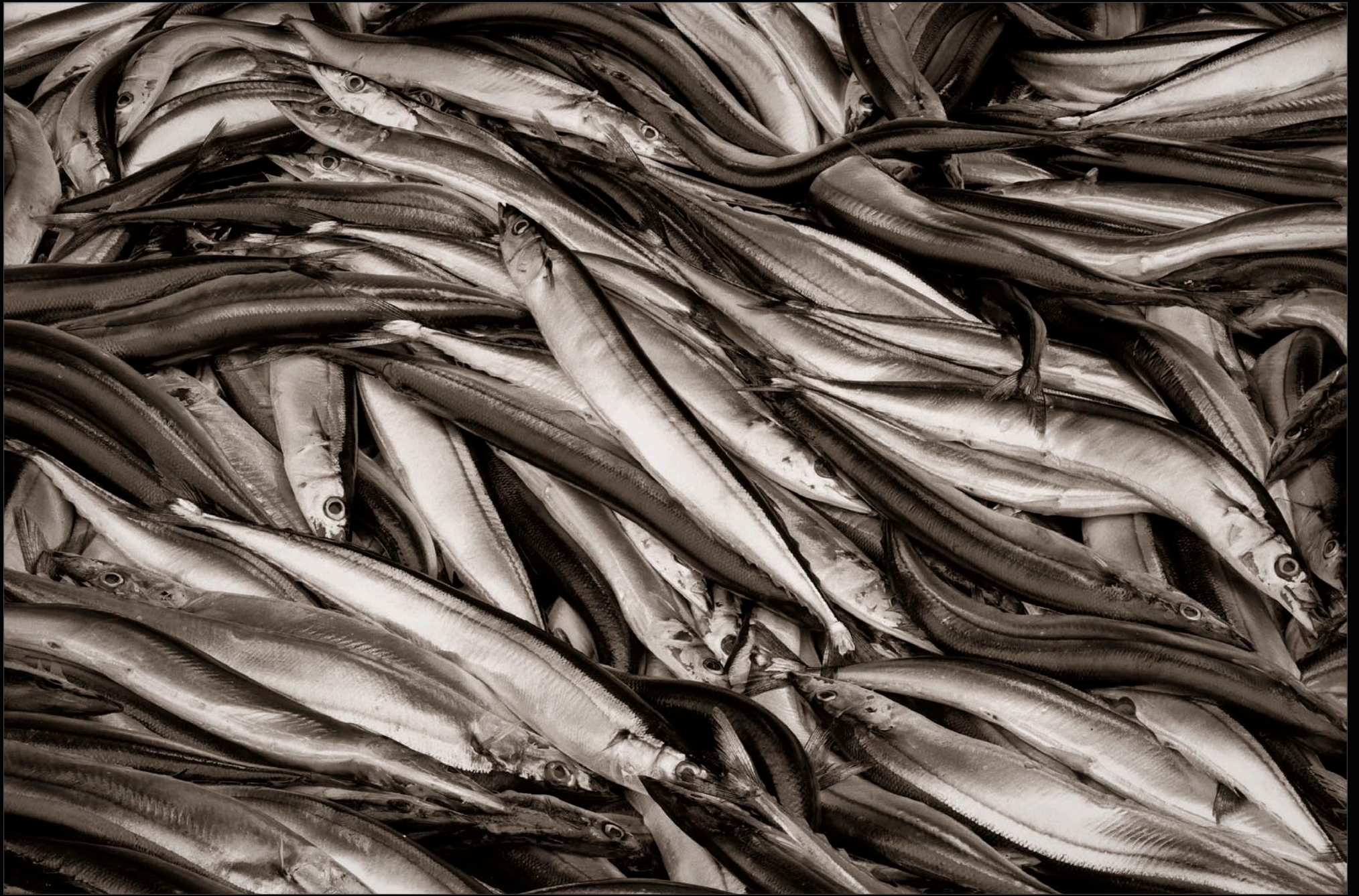
Crate of Fish, Onagawa, Japan