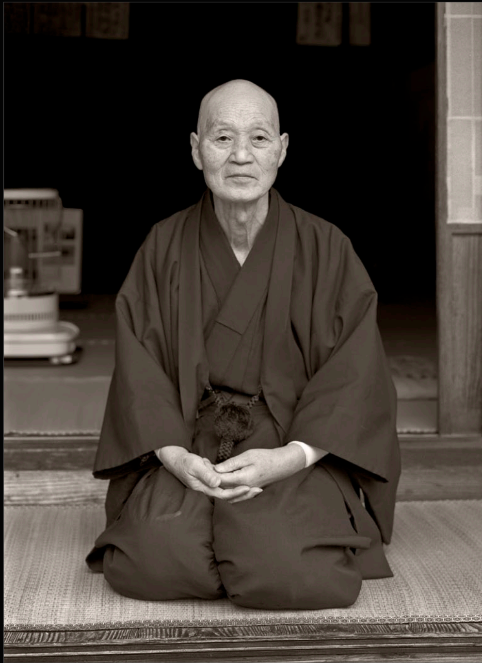
Priest at Tozen-in Temple, Tohoku, Japan