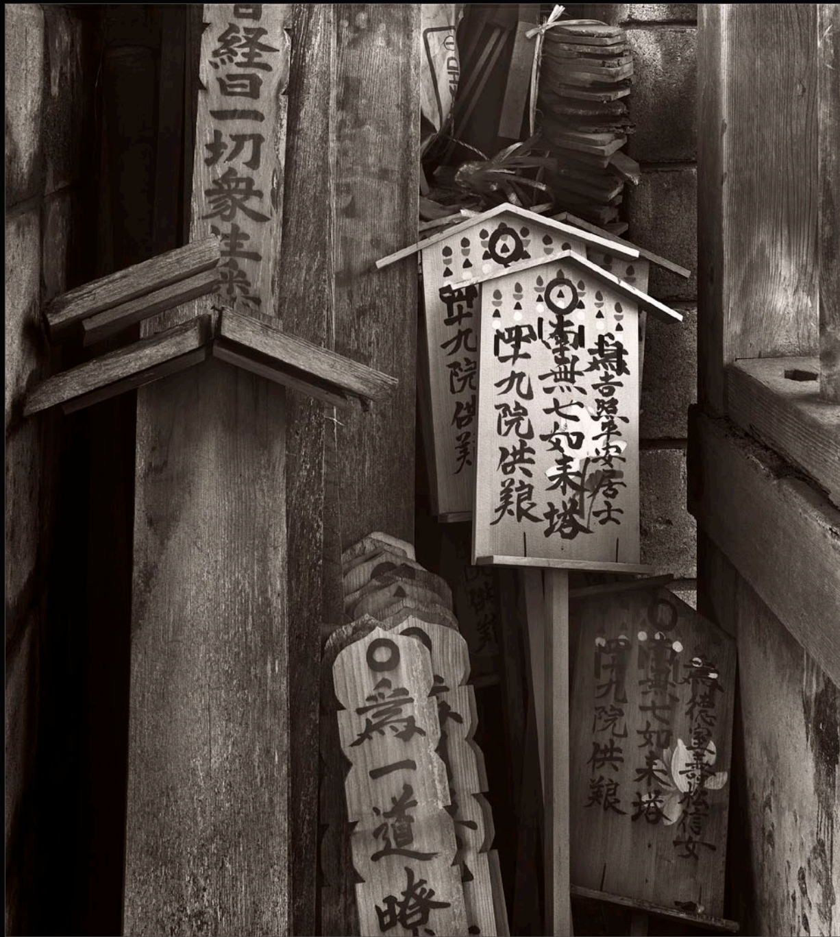
Cemetery Signs, Kyokurin-ji, Odate, Aomori-ken, Japan