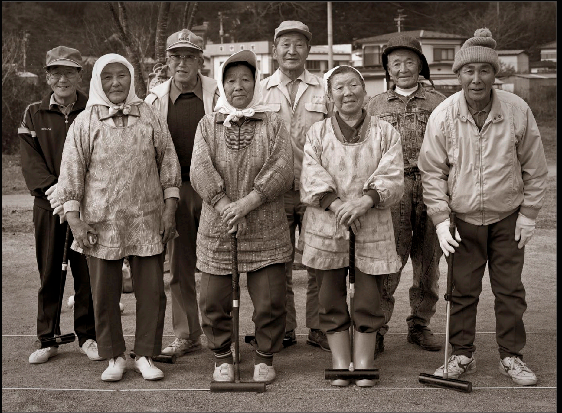
Croquet Players, Iwate Funakoshi, Japan