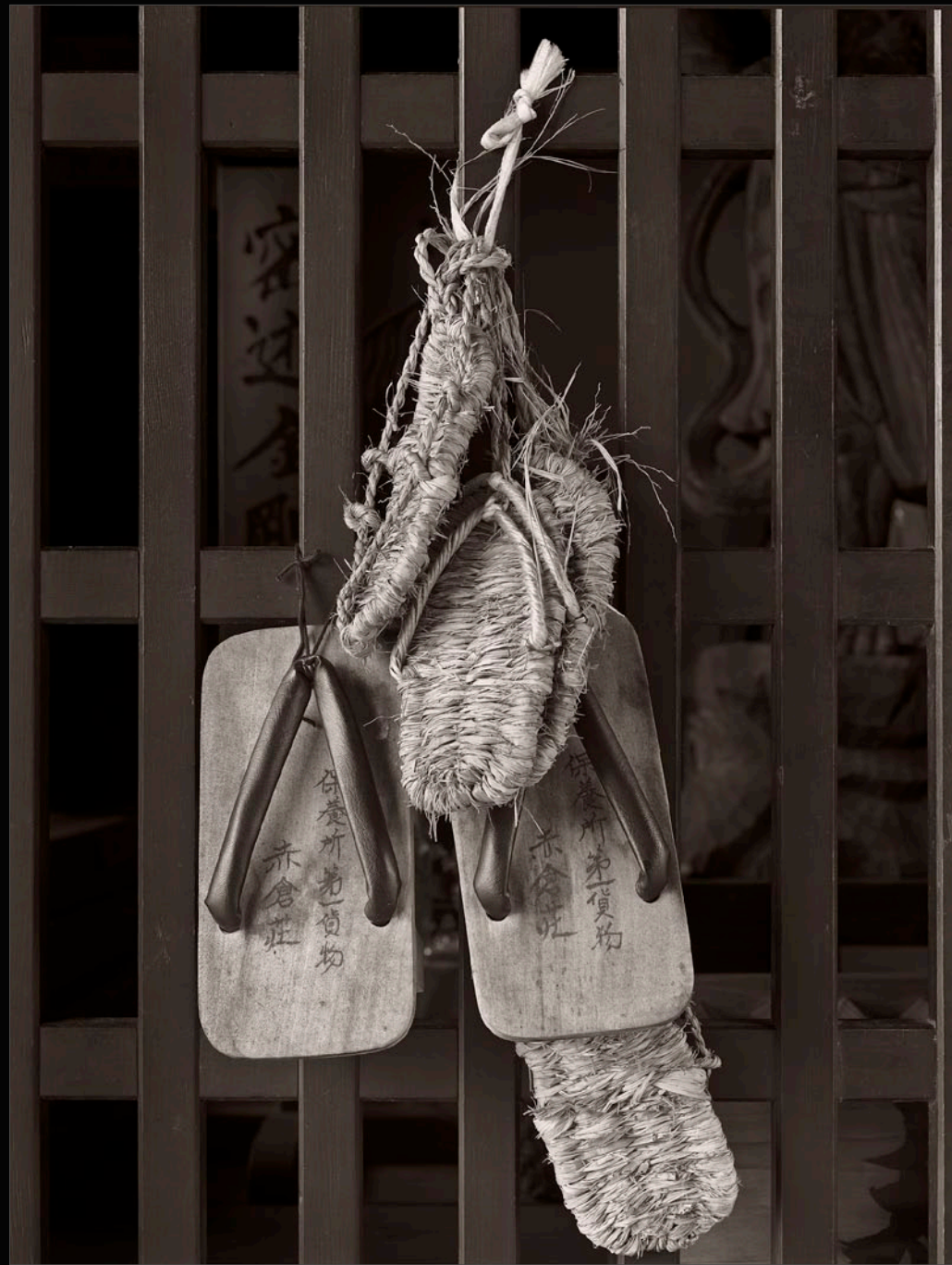
Hanging Sandals, Daikoji Temple, Senmaya, Iwate-ken, Japan