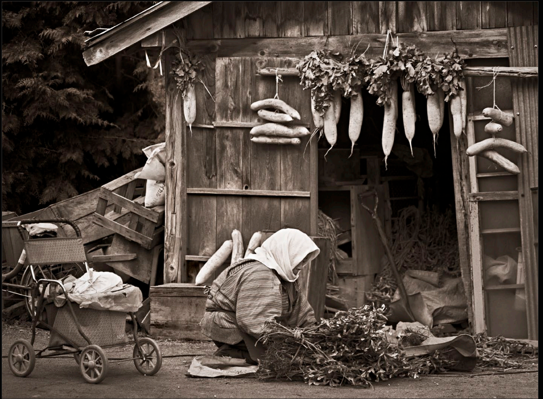
Woman Harvesting Seeds, Ushirogata, Aomori-ken, Japan