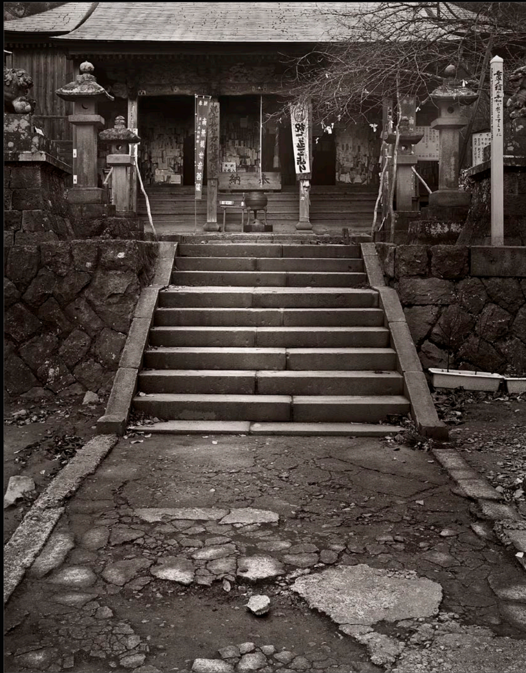
Steps at Tozen-in Temple, Uzen-Akakura, Japan